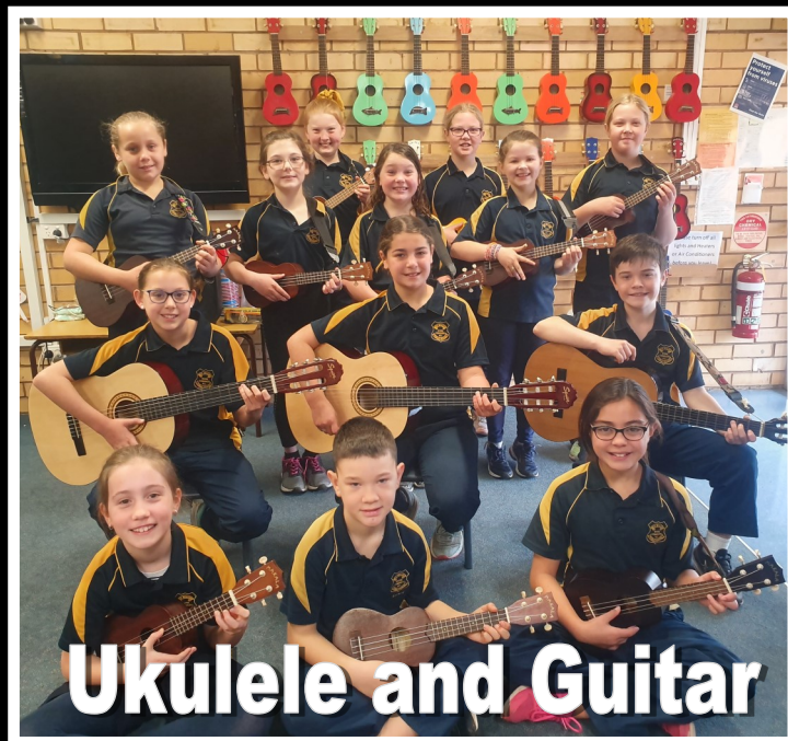
Ukulele and Guitar