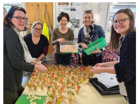
The teachers cutting up fruit and filling 240 cups for the students.